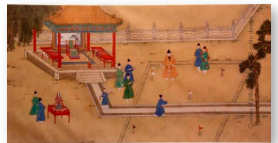
A court painting showing the Xuande Emperor of the Ming Dynasty playing ChuiWan

scholars assert that it was the Chinese who invented the game, and it was then exported to the West by the Mongols. We at Flagstick don't wish to enter the fray on this one – we just prefer to build the courses and play them – but it is certainly another interesting golf-in-China story. If you'd like to read more, a quick Google search will pull up articles from the New York Times and a variety of other sources.