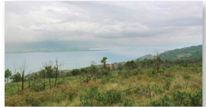
Overlooking Dali's Lake Erhai from the future site of Dali Reignwood

The development methods at Dali Reignwood will emphasize "green" construction practices to ensure an environmentally friendly and sustainable atmosphere. Construction is scheduled to begin in September, and all 36 holes will be completed by the spring of 2013.