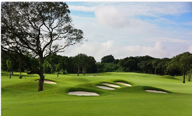
Top: Honda LPGA Thailand at Siam Country Club Middle: Tournaments Logos Bottom: Mission Hills Haikou (Vintage Course)