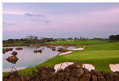
Top of Page: The Dunes at Shenzhou Peninsula