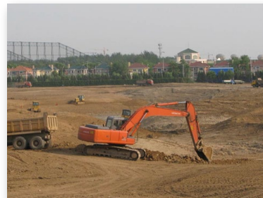
左：杰克·尼克劳斯和首席设计师Ken Baker，在Flagstick团队及其他人员的陪同下查看设计图纸 上：挖掘机，推土机和卡车忙于大规模的施工工作