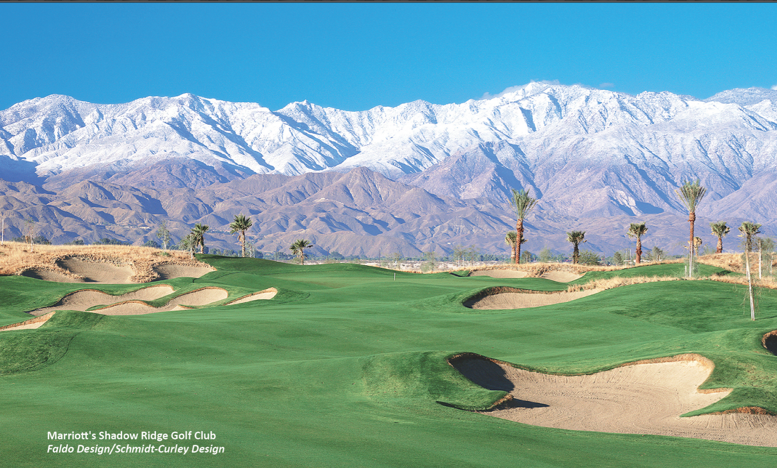
Marriott's Shadow Ridge Golf Club Faldo Design/Schmidt-Curley Design