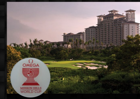
Mission Hills Haikou (Blackstone)