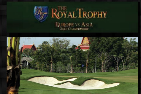
Amata Spring Country Club