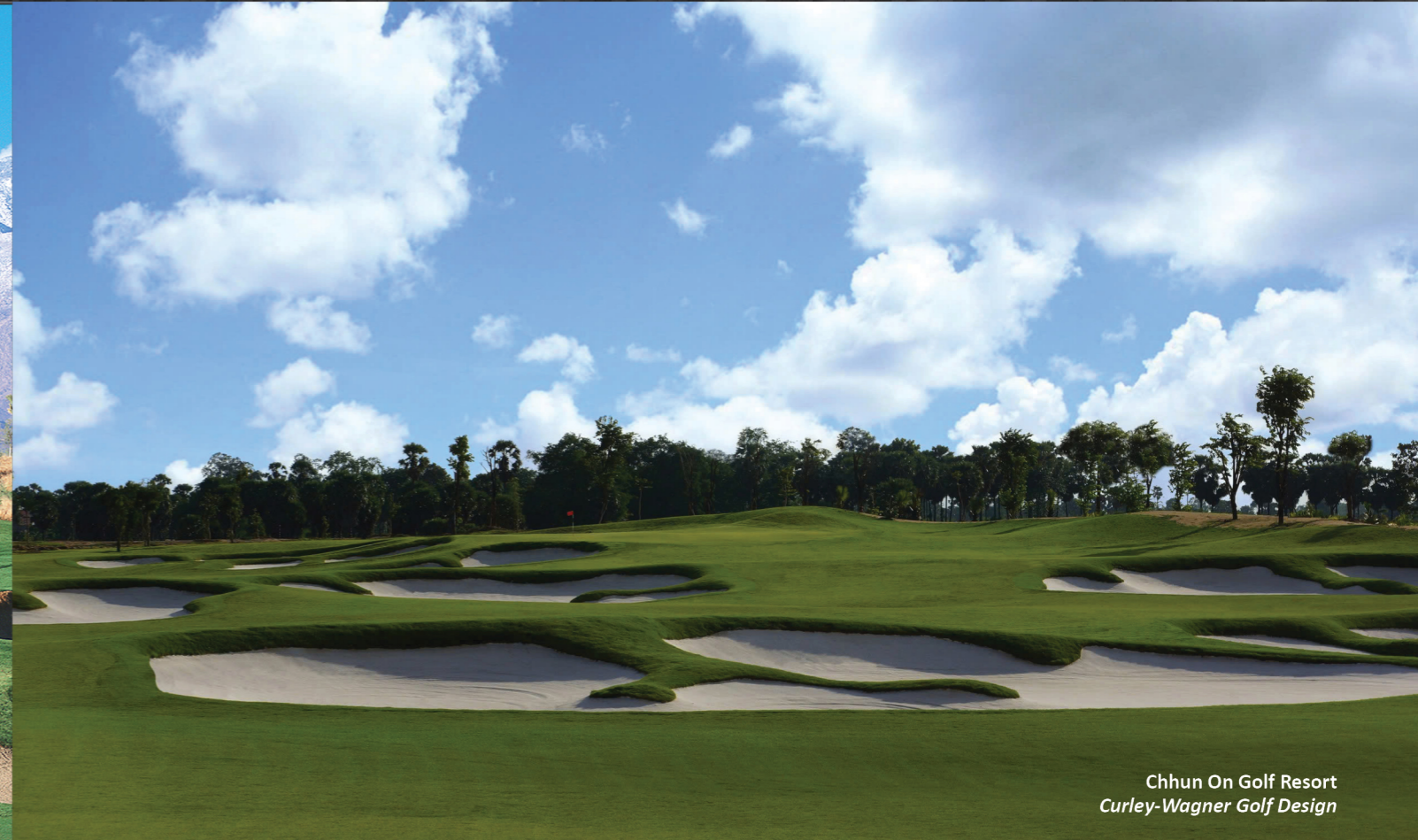
Chhun On Golf Resort Curley-Wagner Golf Design

F lagstick's Golf Course Construction Management Services are built on decades of experience and more than 130 projects worldwide. Our system has been tested in demanding site conditions and proven to deliver consistent results under close technical and financial scrutiny. The Flagstick Operating Procedure combines a flexible-yet-comprehensive construction management framework with one of the most rigorous documentation and reporting systems in the golf industry.