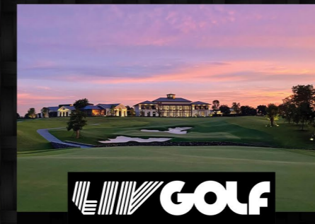
Stonehill Golf Club